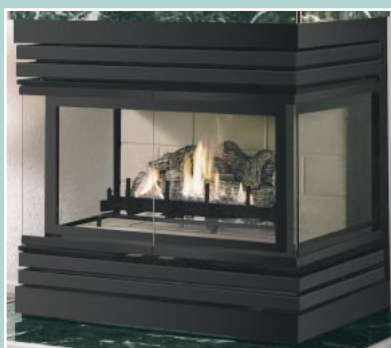
Model M38DV-PRC shown with Satin Black wrap-around trim