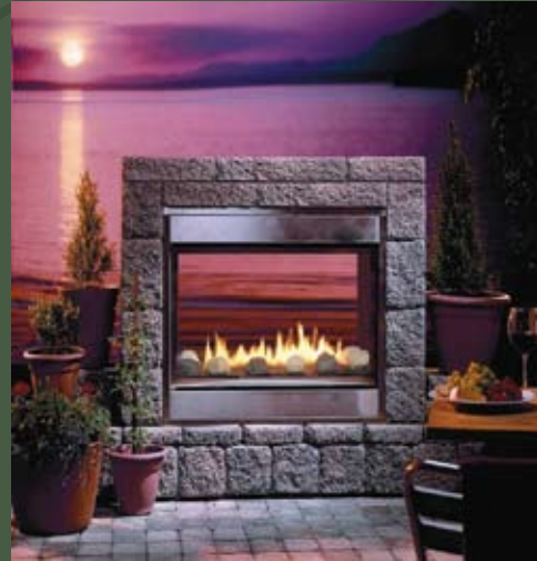
H38VO-ST Vent-free Stainless Outdoor shown with rock surround and Optional River rocks