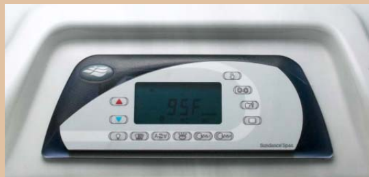
2010 Topsiside Control