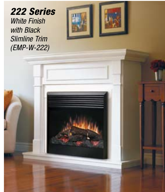
222 Series White Finish with Black Slimline Trim (EMP-W-222)