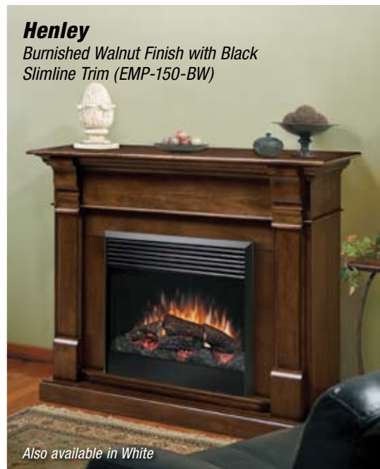
Henley Burnished Walnut Finish with Black Slimline Trim (EMP-150-BW)