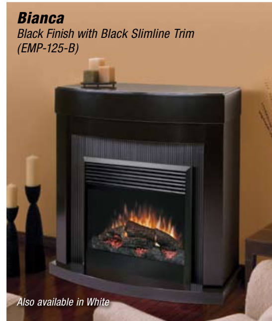
Bianca Black Finish with Black Slimline Trim (EMP-125-B)