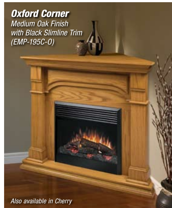
Oxford Corner Medium Oak Finish with Black Slimline Trim (EMP-195C-O)