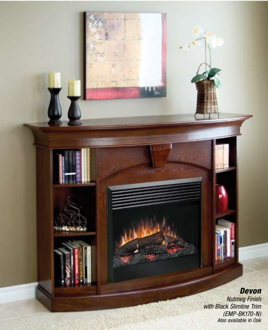
Devon Nutmeg Finish with Black Slimline Trim (EMP-BK170-N) Also available in Oak