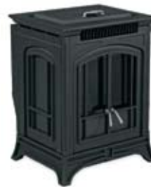
Painted Black Bella stove