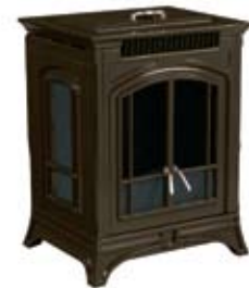
Espresso Brown enamel Bella stove

On the cover: Espresso Brown enamel Bella™ stove shown with Traditional brick panel kit, decorative log set and Gallo Veneziano stone inset panels.