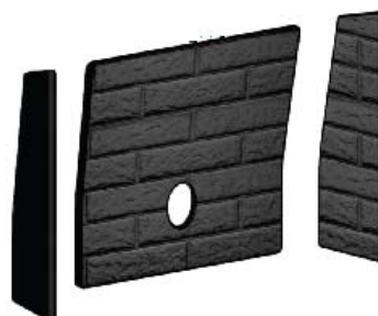
Traditional brick panel kit