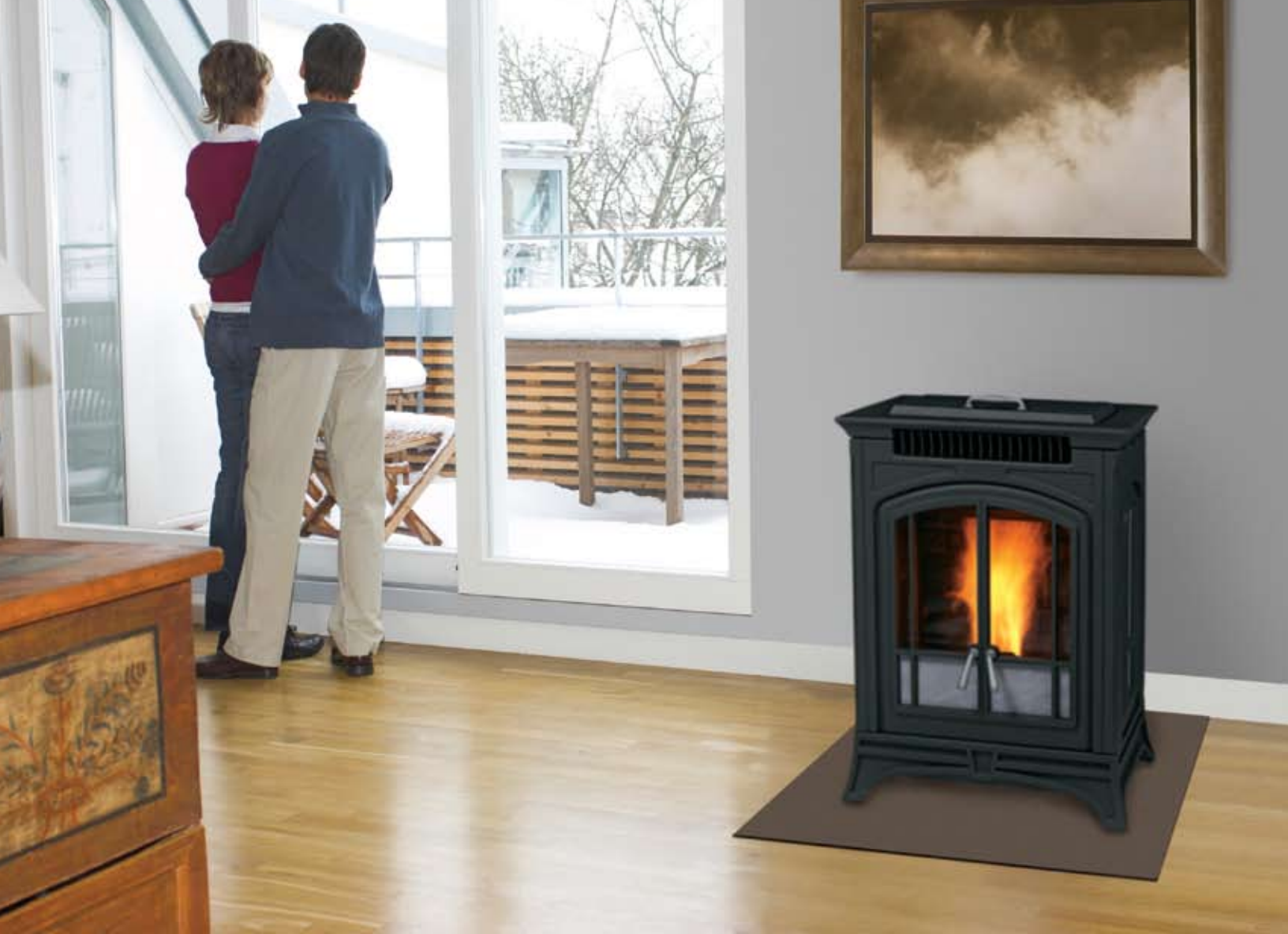
Painted Black Bella™ shown with Traditional brick panel kit and Beatrice Soapstone stone inset panels.

■ The Country Collection Bella™ pellet stove transcends time with a stunning design that fuses contemporary lines with traditional curves. The Bella's premium technological features—such as an innovative LCD screen that displays the stove's operating mode—allow easy, uncomplicated operation. Quiet, efficient operation is assured through a direct-current brushless auger motor, an isolated double-cushioned combustion fan, and advanced controls that adjust feed rates based on whether the fan is on or off. This cast-iron beauty unites the classic charm of yesterday with the dynamic performance of tomorrow. ■