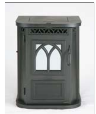
Cast-iron Gothic Arch