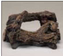
Decorative log set