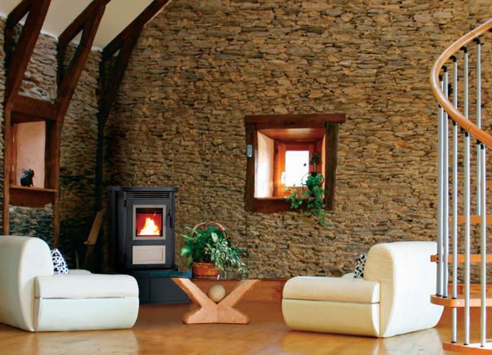
Montage™ shown with Contemporary trim kit

■ The Montage™ pellet stove is truly designed for modern times. With four distinct trim kits, the Montage can be customized to fit nearly any décor. Because the large hopper and automatic feed system erase the need for steady fire maintenance, using the stove is easy, unproblematic and economical. In fact, the Montage effectively burns standard-grade fuel, saving expense while delivering dependable, low-maintenance heat. This stove is the ultimate in modern comfort—beauty, efficiency and, above all, performance. ■