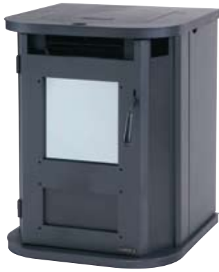
Montage™ pellet stove shown without required trim kit